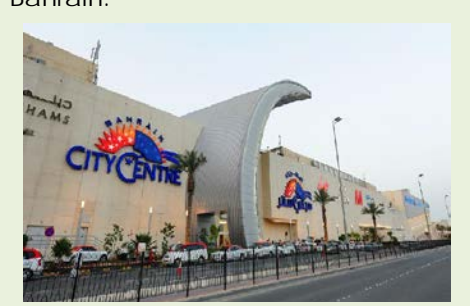
Well done to all concerned!

Once again, QZS proves its excellent quality of service to our clients by successfully securing another 3-Year contract to provide cleaning services with City Centre Bahrain.